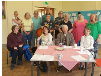
A Dementia-Friendly Coffee Morning

Alongside the Harlow Dementia Action Alliance, St Mary at Latton church and Rainbow Services, we started a Dementia Friendly Coffee morning. Beginning on Zoom, this moved face to face, as restrictions began to ease and now meets weekly on a Friday morning.